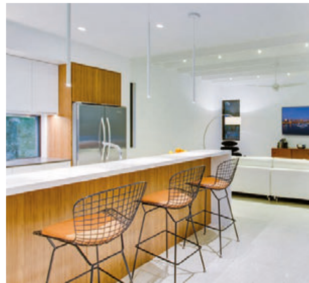
Designer: Leader Design Studio Contractor: Josh Wynne Construction Interior Design: Sawa Design Studio Landscaper: Borden Landscape Design Developer: Latitude 27 Properties