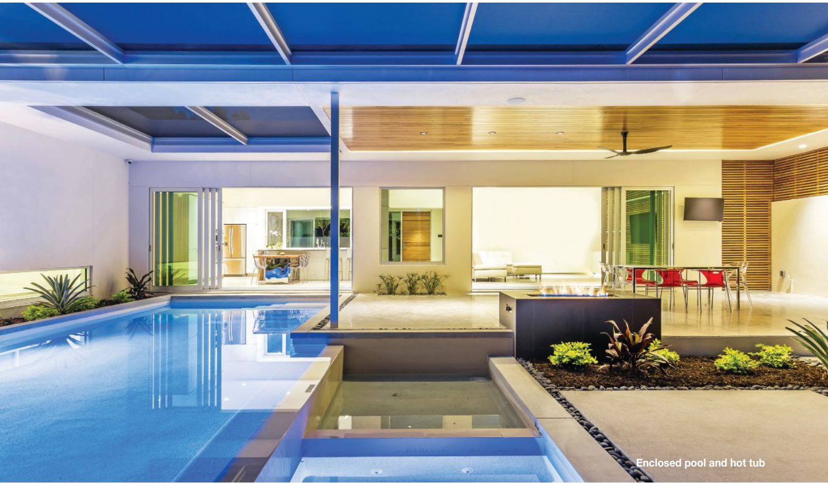
Enclosed pool and hot tub